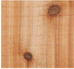
Western Red Cedar - Tight Knot

Western Red Cedar, Alaskan Cedar & Hemlock are the only suitable species for 9mm thick profiles. All Softwood species can be used for 12mm thickness or greater. For external applications, please use 18mm thick profiles or greater.