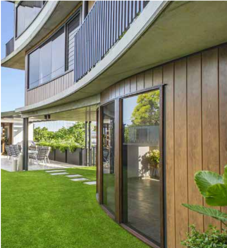
Luxury Residence featuring Alu Seleкта Channel in Dark Cedar