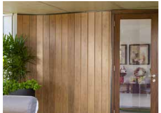
Hotel featuring Alu Battern in Dark Cedar